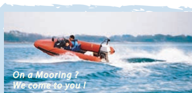
On a Mooring? We come to you!

Smaller vessels can also benefit from combining alternator, wind/solar charging and inverters & batteries.